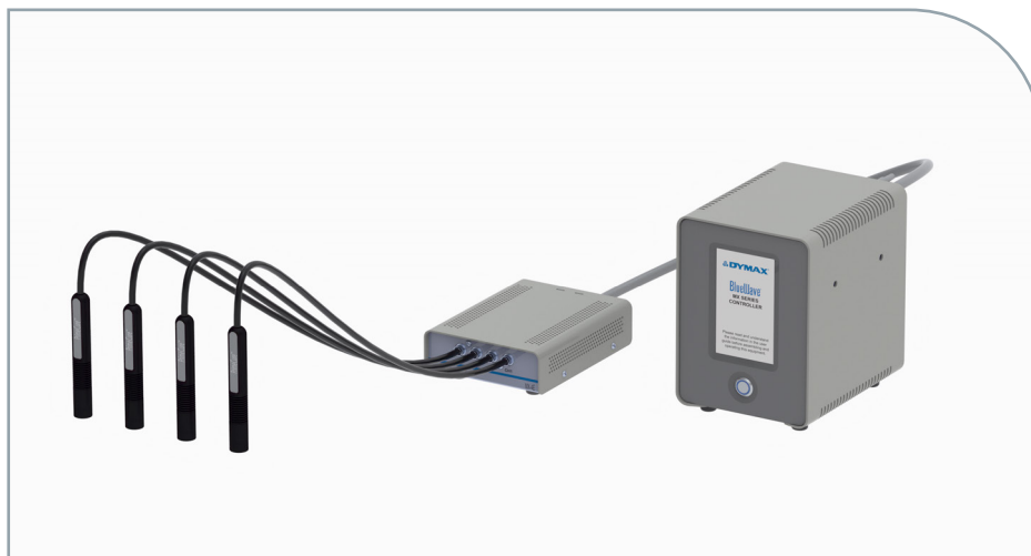
The MX-4E Expansion Module Allows Users to Operate Up to 16 LED Heads with One Controller

** The appropriate power cord will be added for European customers.