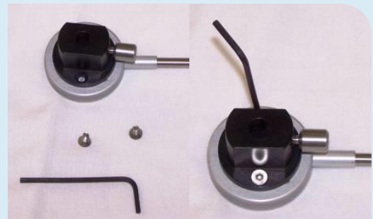
Figure 5. Attach Lightguide Adapter to Lightguide (Step 4)