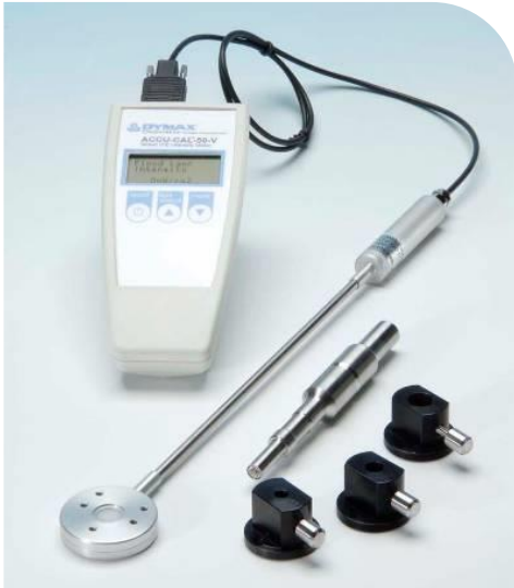
Figure 1. Model 40043 Visible Spot Radiometer