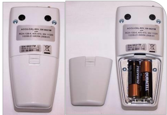
Figure 7. Battery Compartment (Closed & Open)