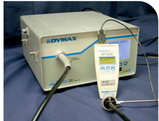
Figure 2. Take initial intensity reading at the end of lightguide

If the lightguide end needs cleaning, attempt to clean it using a tissue and solvent (Figure 3). The recommended cleaning agent is isopropyl alcohol. Chlorine-based solutions can be exceptionally damaging to liquid lightguides and should not be used for cleaning. If the contamination is not removable with solvent, clean the surface with a razor blade (Figure 4). Plastic or metal razor blades can be used. Take care not to chip the edge of the quartz glass window.