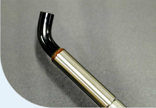
Lightguide End with Collimator Lens